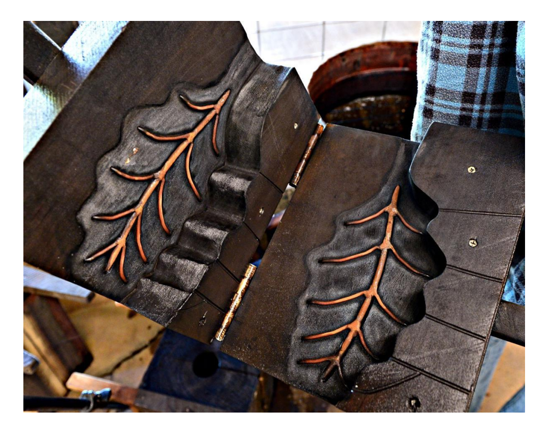
Arlon Bayliss' design is shown here, in the mold that the molten glass will be cast into.