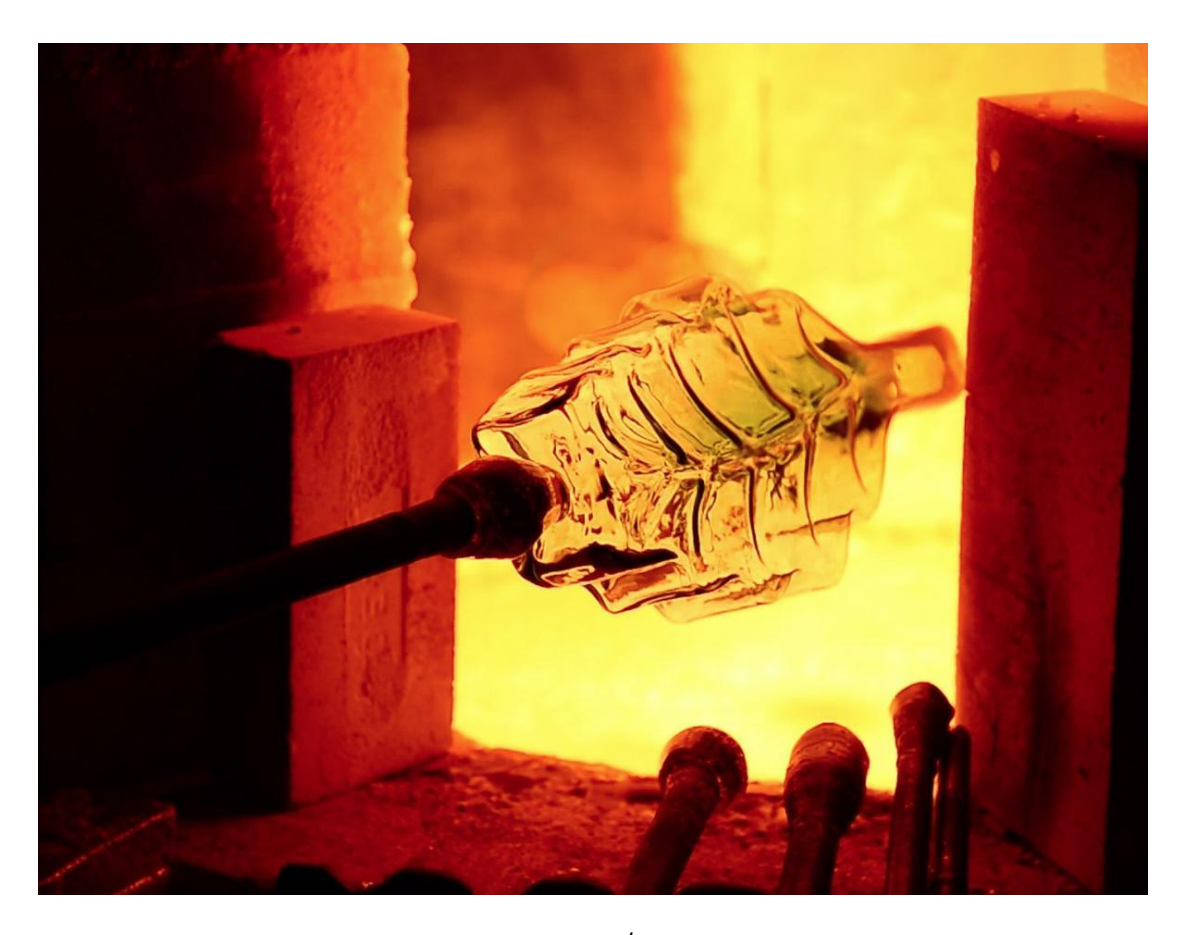
The commemorative piece is fired at Blenko for West Virginia's 152<sup>nd</sup> anniversary.