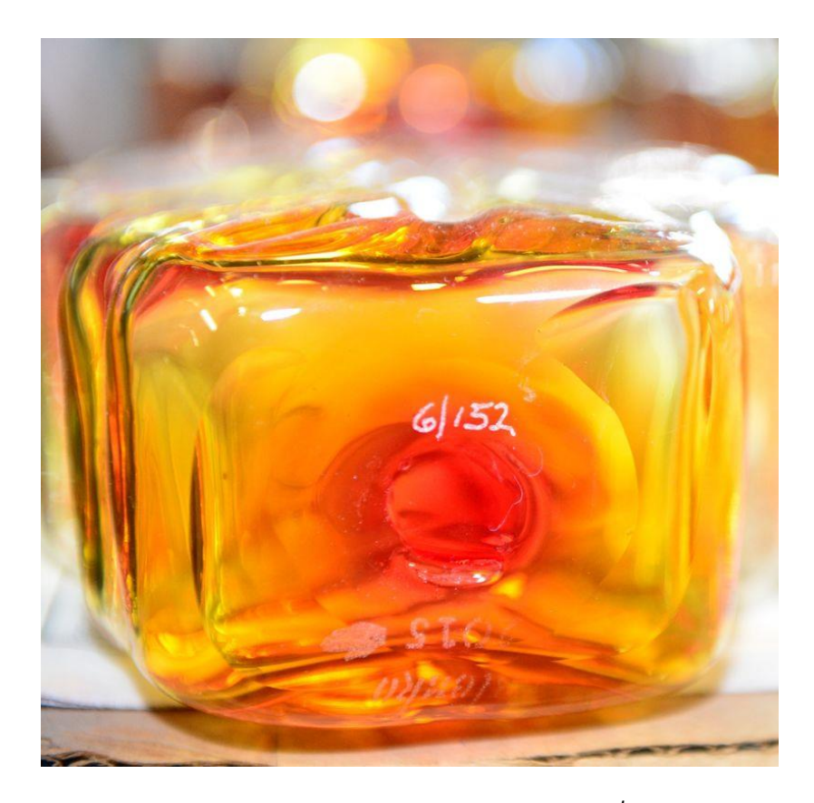
Each Commemorative Autumn Flame is numbered and signed for West Virginia's 152<sup>nd</sup> anniversary.