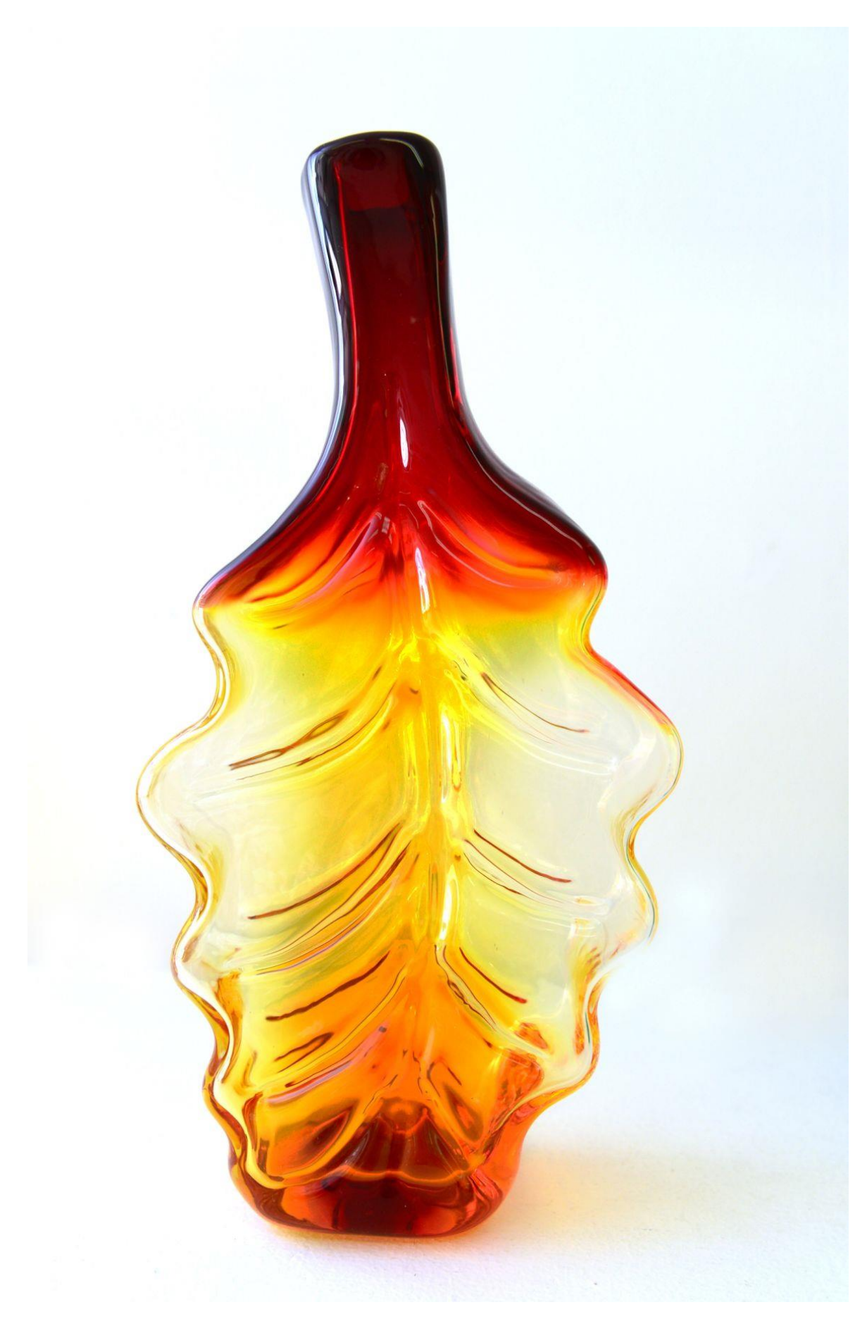
The Autumn Flame, a commemorative piece for West Virginia's 152<sup>nd</sup> statehood anniversary, is displayed at Blenko Glass Company.